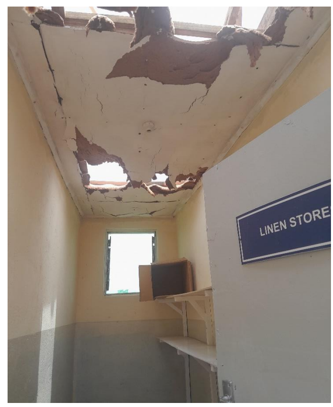
The corridor and the linen store