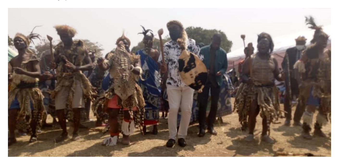
Inkosi Ya Makhosi M'Mbelwa rejoicing during the opening ceremony of Engalaweni Health center

It was all joy in August 2022 when Engalaweni Health center was opened to the public. Traditional, Religious and government leaders all stormed to Engalaweni to witness the opening of the facility. The church and church partners who funded the construction were showered with praises as people sung and danced with joy to have a health facility close to them. Engalaweni is located 30 kilometers south of Mzimba District Hospital, Engalaweni Health Centre serves a population of at least 12,000 people. The health facility is located 15, 12 and 8 kilometers from nearby health facilities of Edingeni, Kamteteka and Manyamula respectively and 30 kilometers from Mzimba District Hospital. It was constructed by the Engalaweni community led by Engalaweni CCAP Church with financial support from Mountain View Presbyterian Church partners in Colorado - USA.