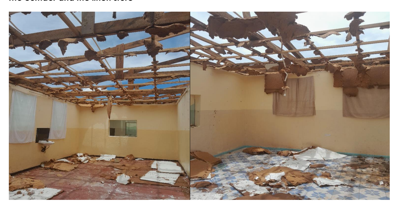
Pre-natal and labour wards

Thank you for any kind of support and prayers inclusive.